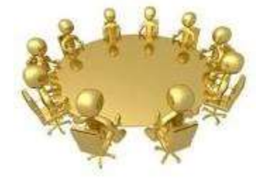
Sep 4 @ 6:30 pm Planning Commission Meeting Location: Town Hall 9212 County Road 97 Perdido Beach, AL 36530 SEPTEMBER 5 (THURSDAY)